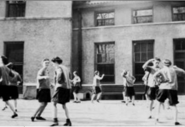
House of Mercy residents exercised in the courtyard, around 1920.