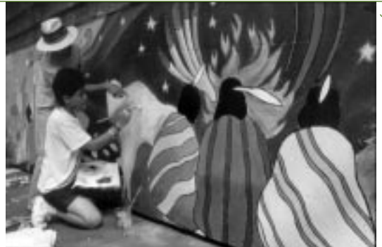
Latin American Youth Center muralists at work, 1988.

The riots of 1968 following the assassination of the Rev. Dr. Martin Luther King, Jr., which devastated the nearby 14th Street corridor, frightened many more residents into leaving. The resulting low housing prices attracted a diverse mix of young people, artists, musicians, and families fleeing political and economic turmoil in Central America, Southeast Asia and elsewhere. By the 1970s Mount Pleasant and nearby Adams Morgan were recognized as the heart of the Latino