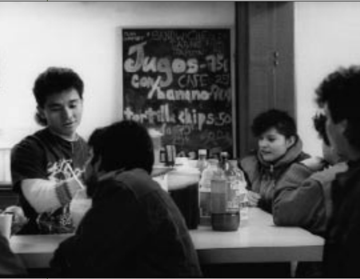
An after-school snack bar at the Wilson Center, 1991.

16TH STREET BETWEEN IRVING AND LAMONT STREETS NW