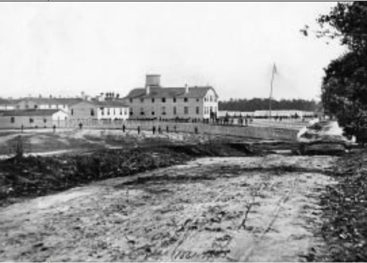
Mount Pleasant Hospital near 14th St. and Park Rd. during the Civil War.