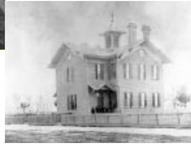
Charles Sumner School Museum and Archives

The village's four-room schoolhouse, 1876.