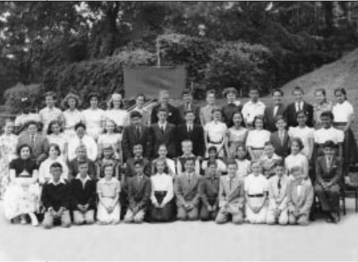
Bancroft Elementary School sixth grade graduates, 1955.