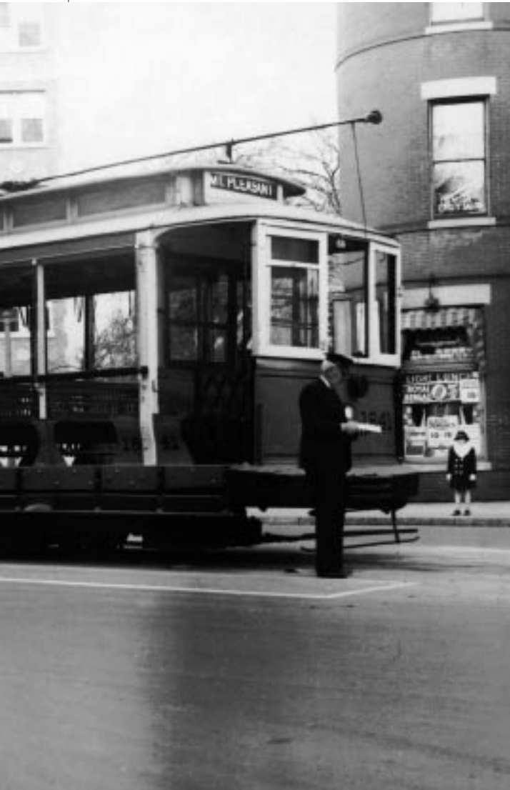
An old streetcar idles on Mt. Pleasant St., photographed around 1935.