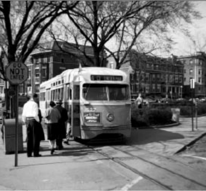
The number 40 streetcar at Lamont St., 1961.