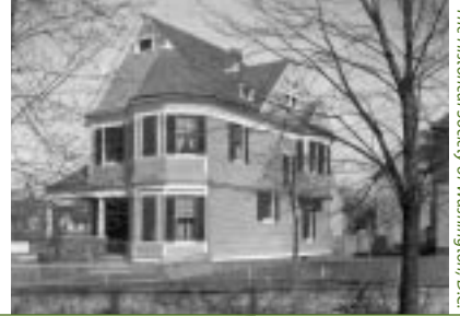
The Historical Society of Washington, D.C.

Change came with the Great Depression and World War II. Washington's population boomed as the U.S. Government staffed up to handle the emergencies. A housing shortage resulted, leading