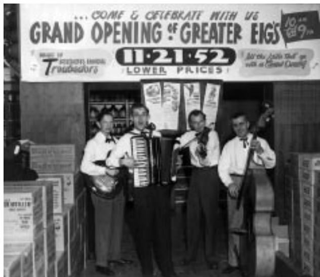
Jimmy Dean, on accordion, and his band, 1952.