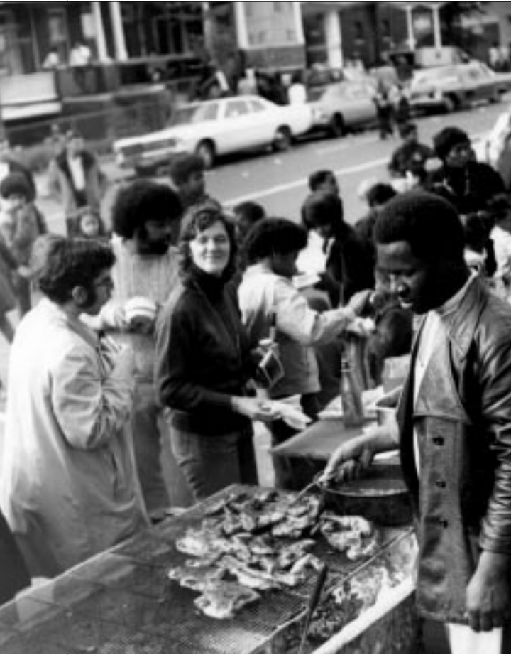
At the Mount Pleasant Festival, 1974.